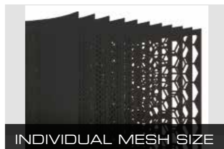
INDIVIDUAL MESH SIZE

The robust brush cleans the mesh during operation.